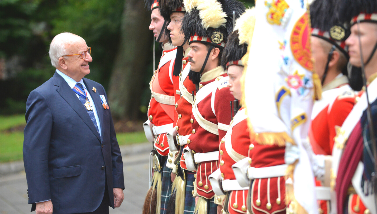
78th Highlanders Freedom of the City Parade. 24 August 2022.

As The King's representative and on behalf of all Nova Scotians, the Lieutenant Governor was also present at 258 events hosted by a wide range of cultural, sporting, civic, heritage, military and volunteer communities.