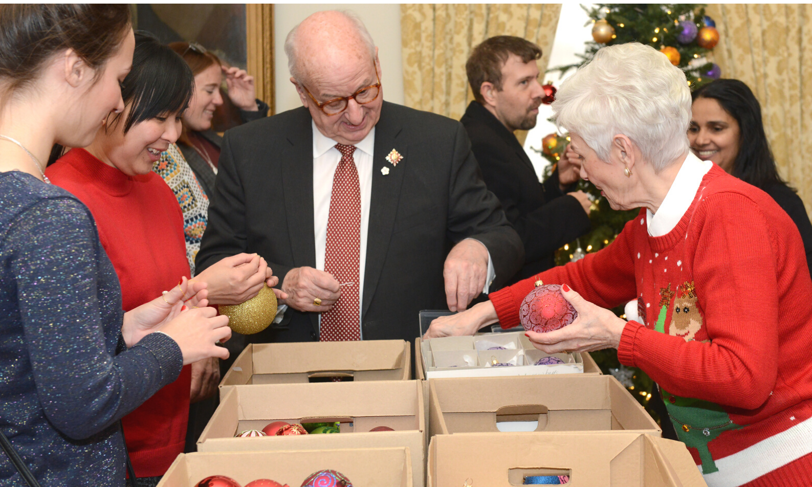
Christmas tree decorating event with L'Arche at Government House. 2 December 2022.

The 2022-23 fiscal year marked the first time since the start of the pandemic that all public programs could resume on a regular schedule at Government House.