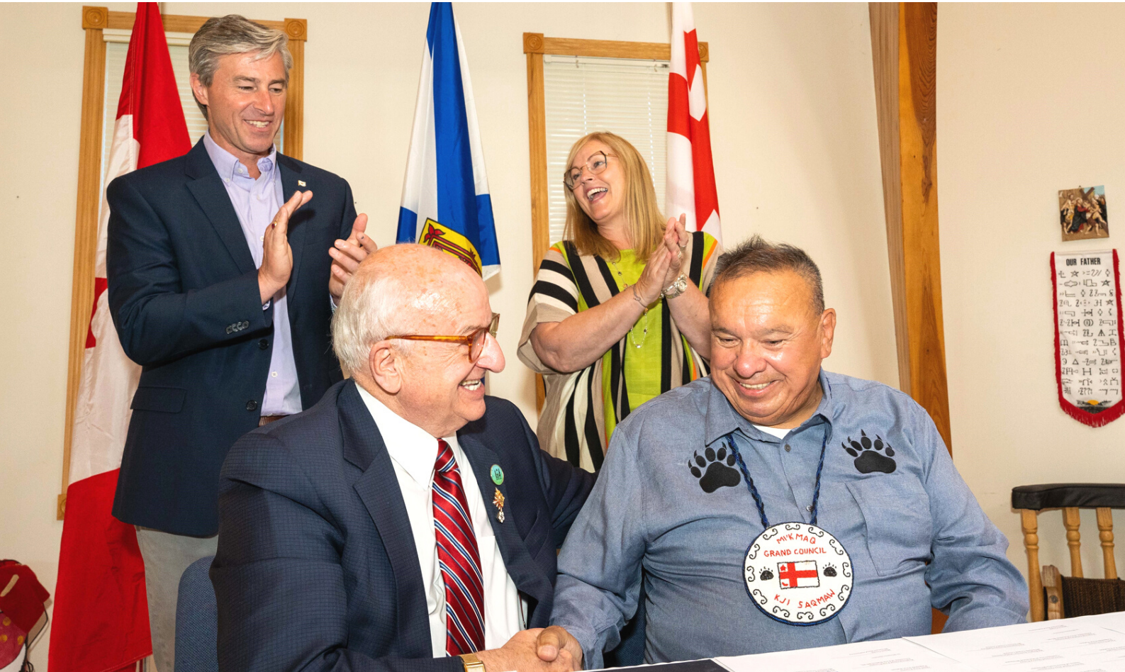
Signing of the Proclamation of the Mi'kmaw Language Act , Potlotek First Nation. 19 September 2022.

A historic moment for all Nova Scotians took place on 17 July 2022, when the Lieutenant Governor signed the Proclamation of the Mi'kmaw Language Act during a ceremony at Potlotek First Nation. Several Mi'kmaw Chiefs, including Grand Chief Norman Sylliboy, signed a resolution to affirm and uphold the provincial legislation on behalf of their communities.