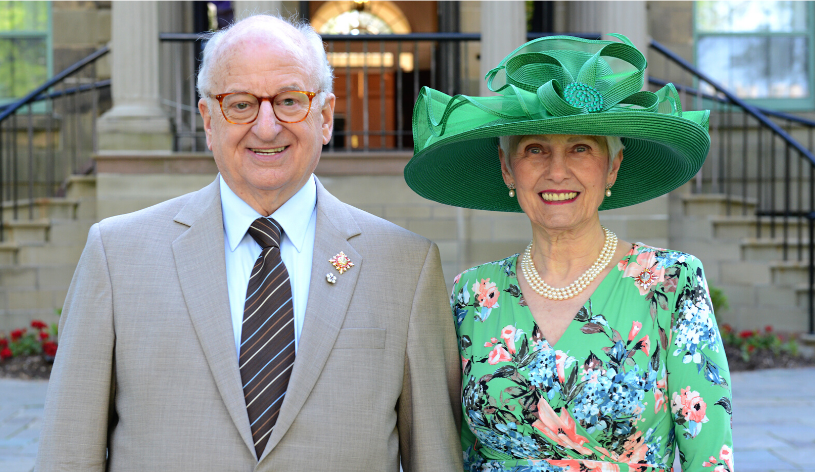
The Platinum Jubilee Garden Party, Halifax. 15 June 2022.