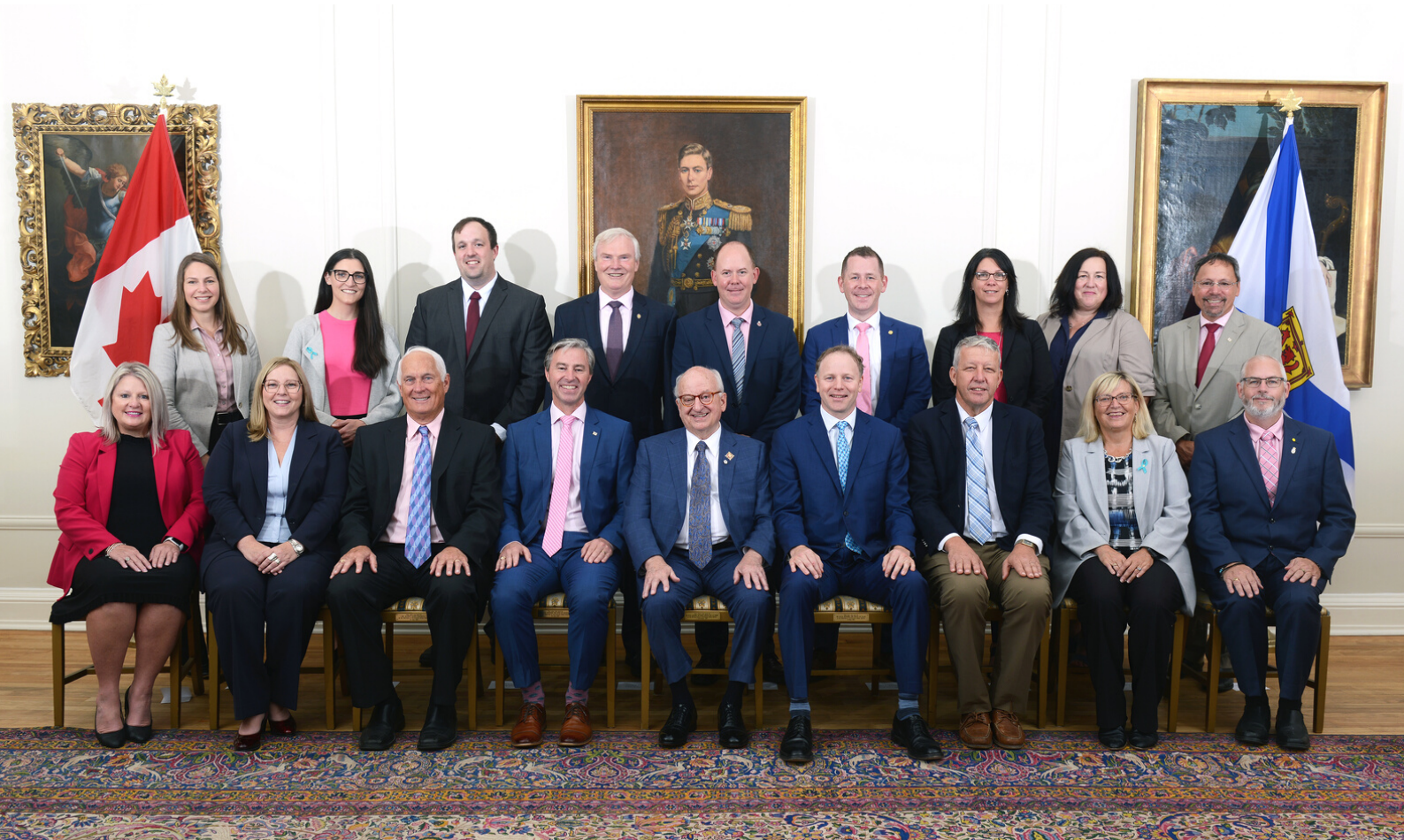
The annual Cabinet Meeting at Government House. Morning of 8 September 2022.

On 10 September 2022, two days after the passing of Queen Elizabeth II, the Lieutenant Governor, Premier, members of the Executive Council and Chief Justice, the Grand Chief and Grand Keptin, and representatives from the Canadian Armed Forces and Royal Canadian Mounted Police gathered at Government House for the Accession Proclamation Ceremony.