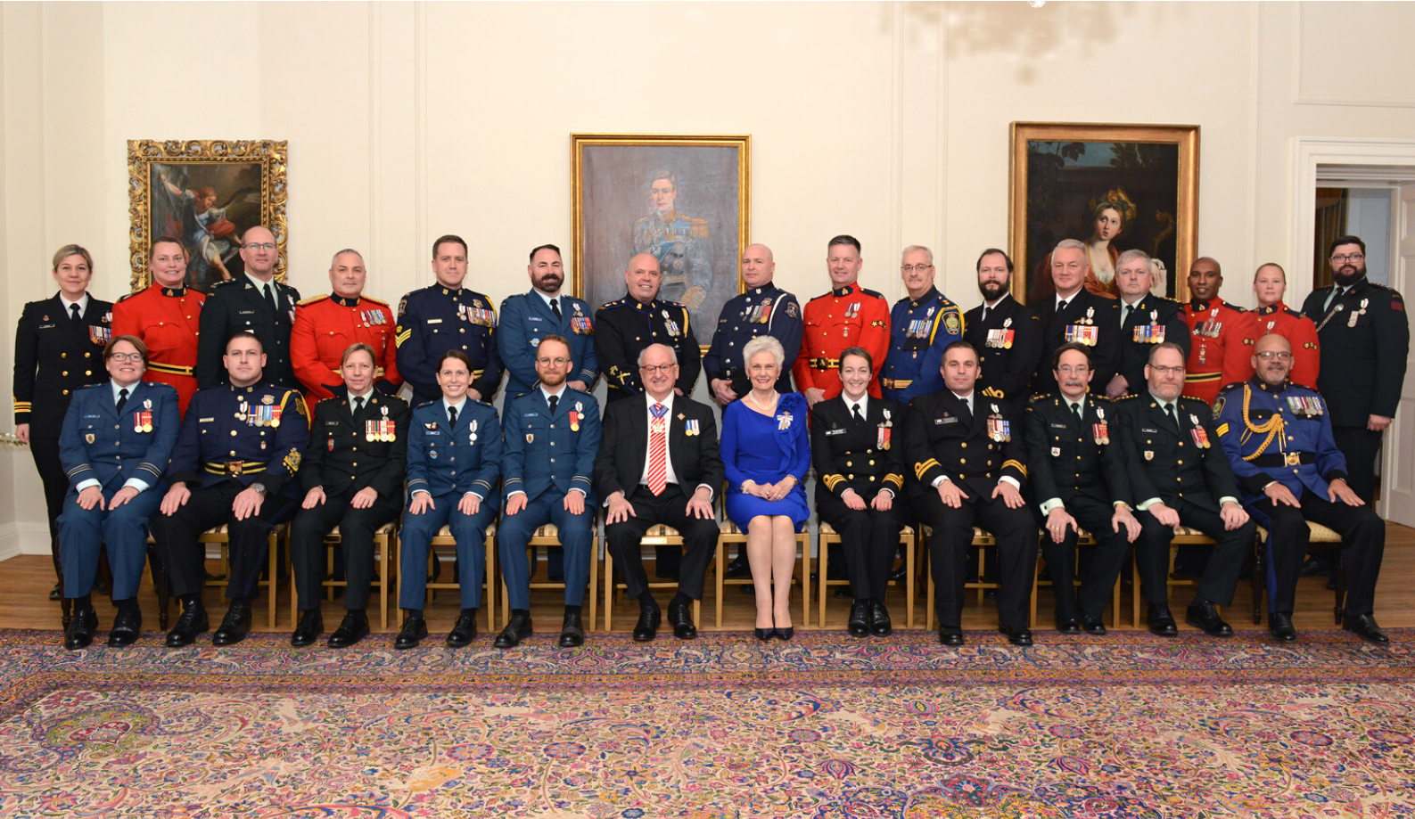
The Queen Elizabeth II Platinum Jubilee Medal Investiture. 15 December 2022.

The cadre of 31 Honorary Aides-de-Camp, comprised of members of the Royal Canadian Navy, Canadian Army, Royal Canadian Air Force, Royal Canadian Mounted Police, Halifax Regional Police, Cape Breton Regional Police Service and New Glasgow Regional Police, volunteered 2,114 hours aiding the Lieutenant Governor in discharging his duties throughout Nova Scotia.