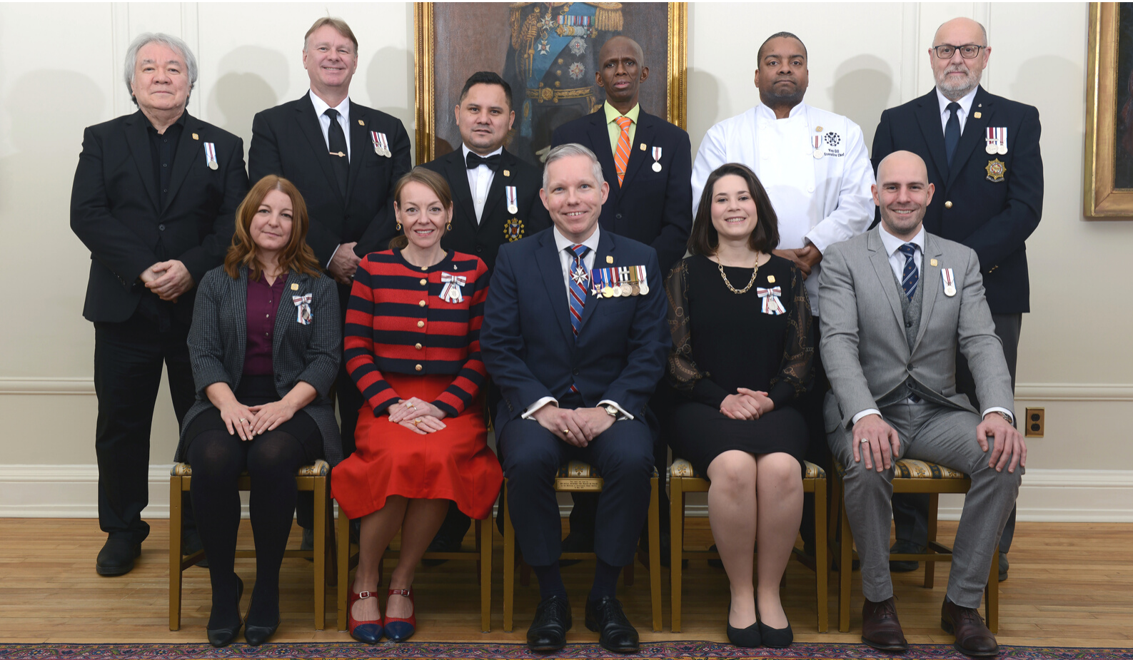
The Vice-Regal Household Staff. January 2023.