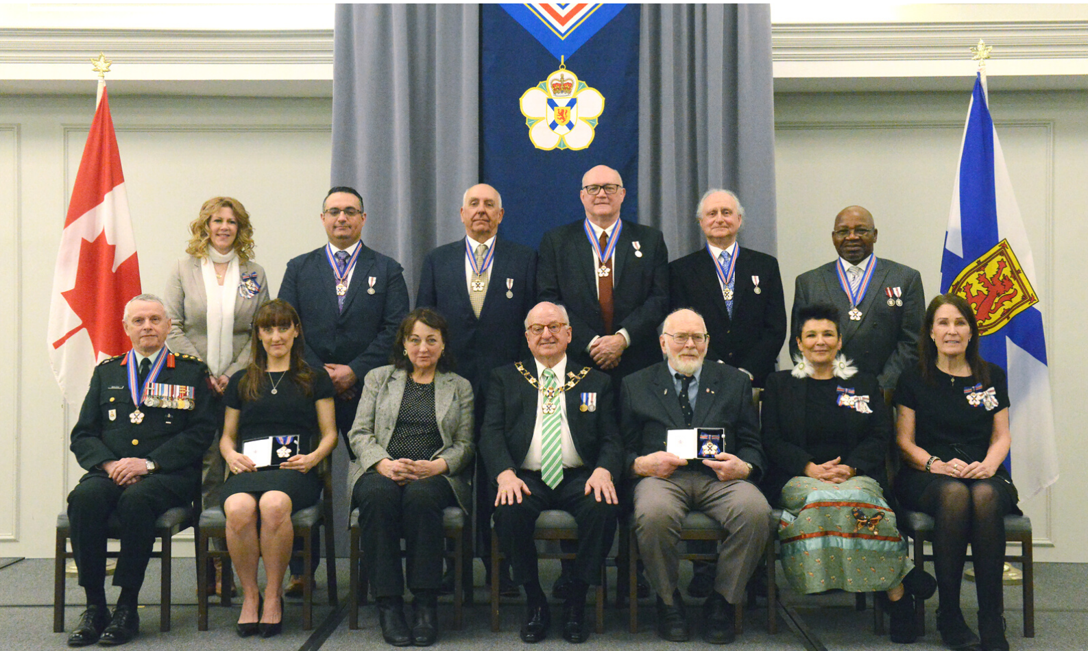
Order of Nova Scotia Investiture. 28, March 2023.

Throughout the year, the Lieutenant Governor honoured Nova Scotians for significant and long-term achievements and service to their communities, the province and the country.