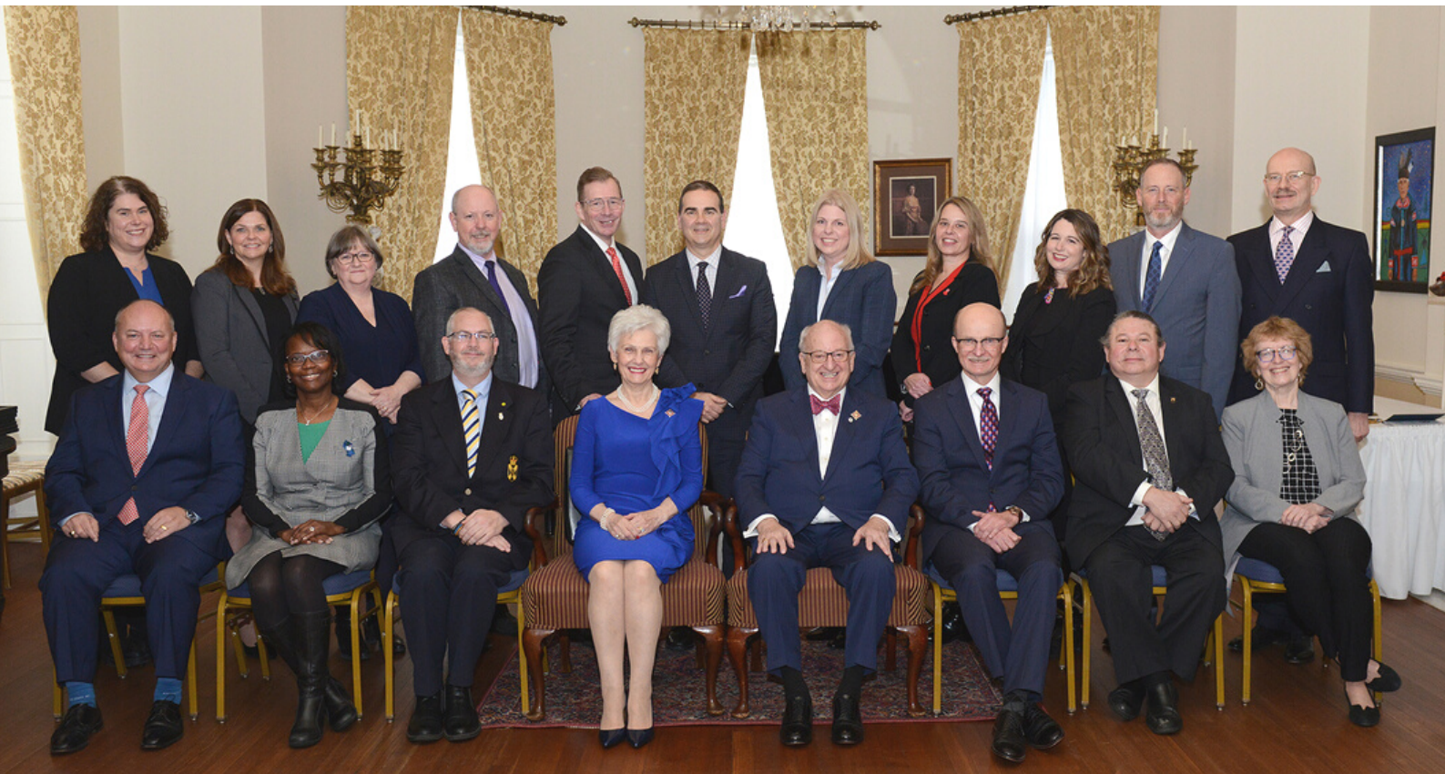
The Queen's Counsel Commissioning Ceremony at Government House. 9 December 2021.