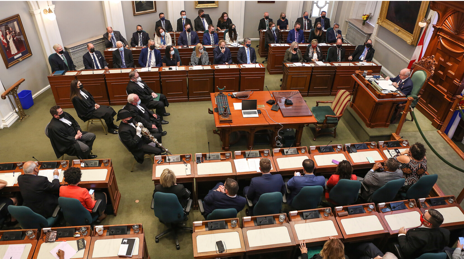
His Honour delivering the Speech from the Throne. 12 October 2021.

At the request of the Premier Iain Rankin, the Lieutenant Governor dissolved the House of Assembly and called a general election on 17 July 2021. Following the election results, Mr. Rankin notified the Lieutenant Governor of his intention to resign as Premier of Nova Scotia. In turn, the Lieutenant Governor received Mr. Tim Houston, leader of the Progressive Conservative Party, and requested that he form a new government.