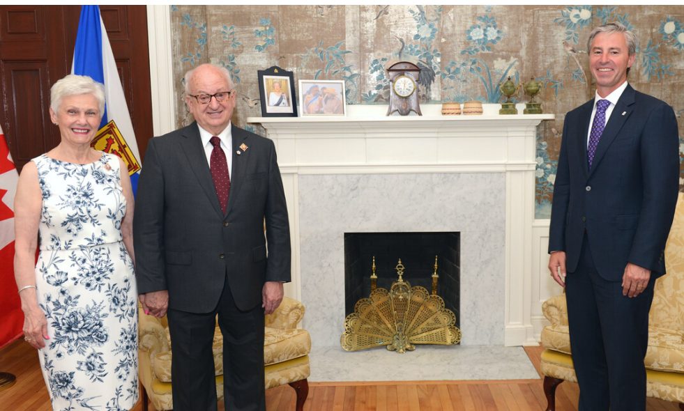
Transfer of the Great Seal to the Minister of Justice, the Honourable Brad Johns. 31 August 2021.