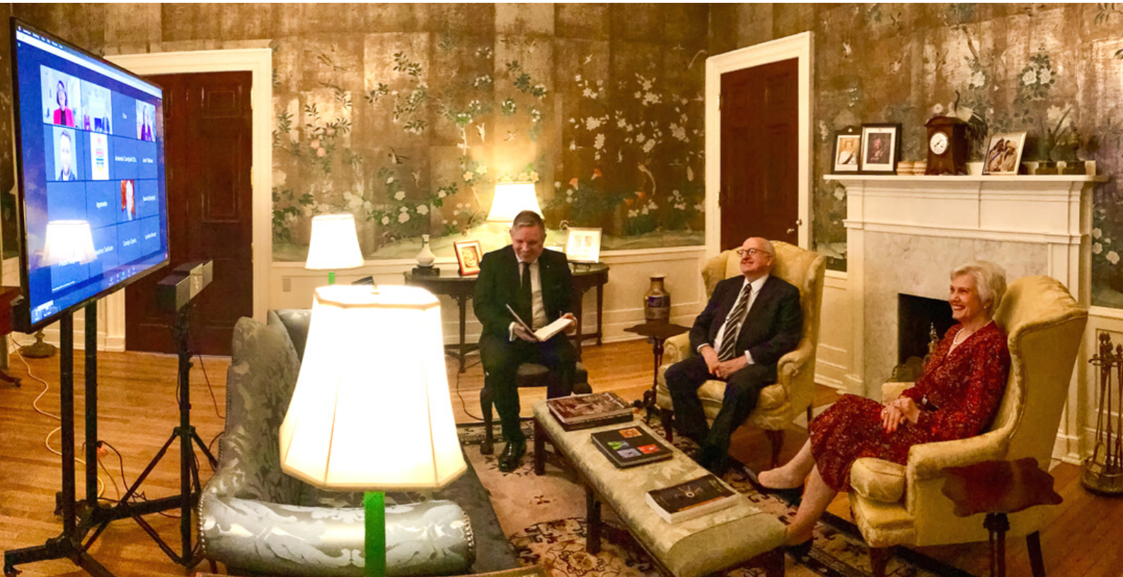
Their Honours participating in a virtual meeting of the Canadian Vice-Regal family. February 2022.

Due to COVID-19 pandemic, the Province remained under a state of emergency during the 2021-22 fiscal year. Despite restrictions on gathering limits and physical distancing requirements, strong engagement with Nova Scotians continued due to the Lieutenant Governor's online presence.