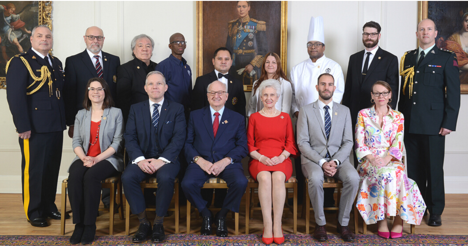
Their Honours and the Vice-Regal Household Staff. January 2022.