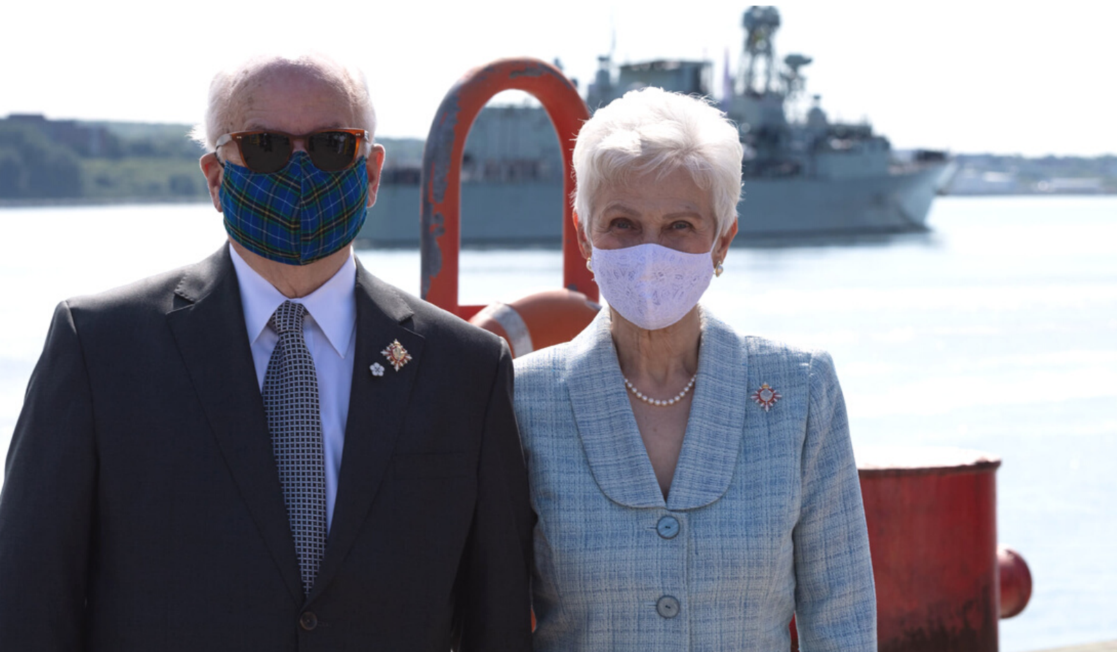
Deployment of HMCS FREDERICTON. 24 July 2021.