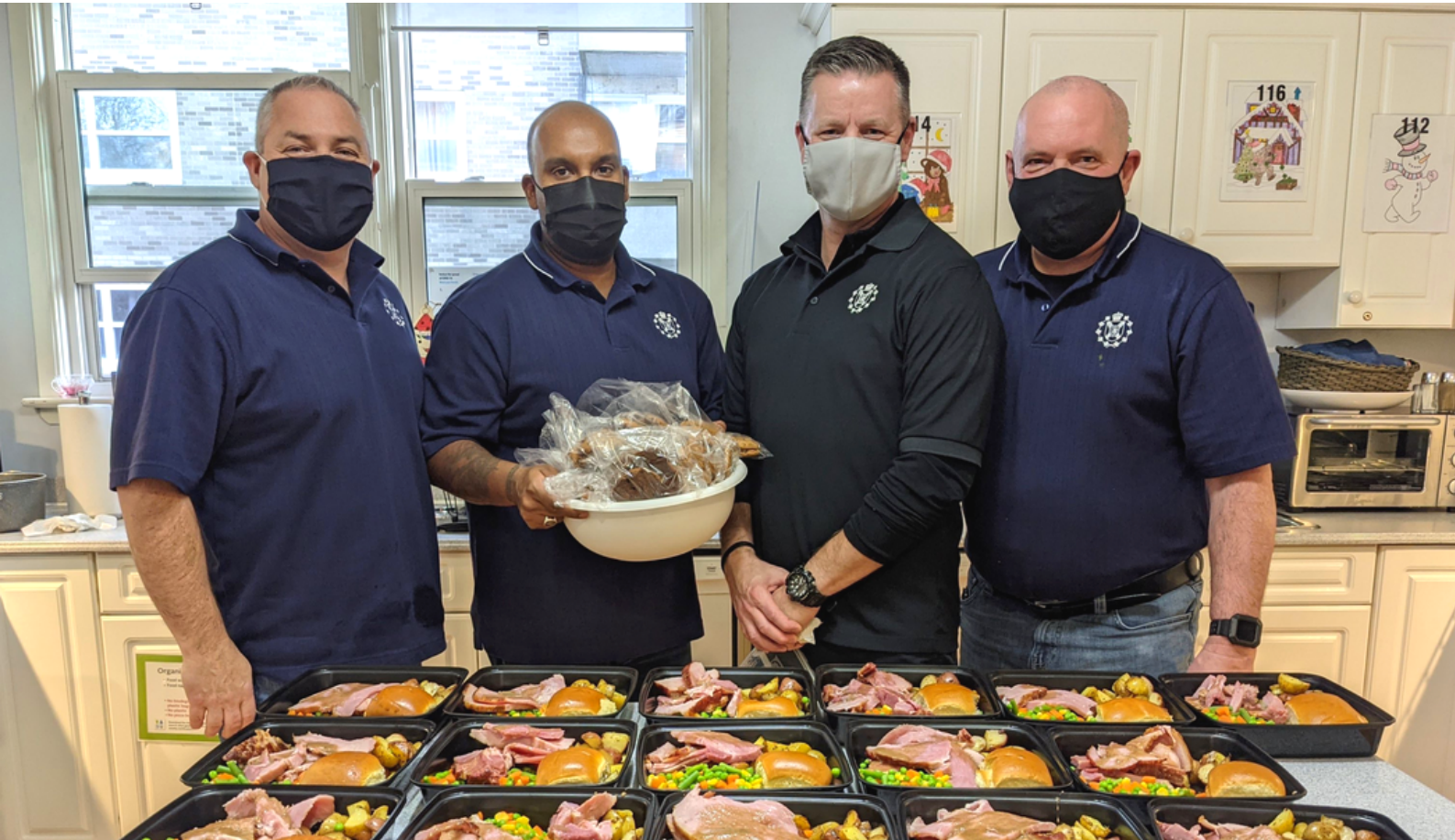
Meal preparation at the Ronald McDonald House Atlantic. December 2021.

The cadre of 31 Honorary Aides-de-Camp, comprised of members of the Royal Canadian Navy, Canadian Army, Royal Canadian Air Force, Royal Canadian Mounted Police, Halifax Regional Police, Cape Breton Regional Police Service and New Glasgow Regional Police, volunteered 1,145 hours aiding the Lieutenant Governor in discharging his duties throughout Nova Scotia.