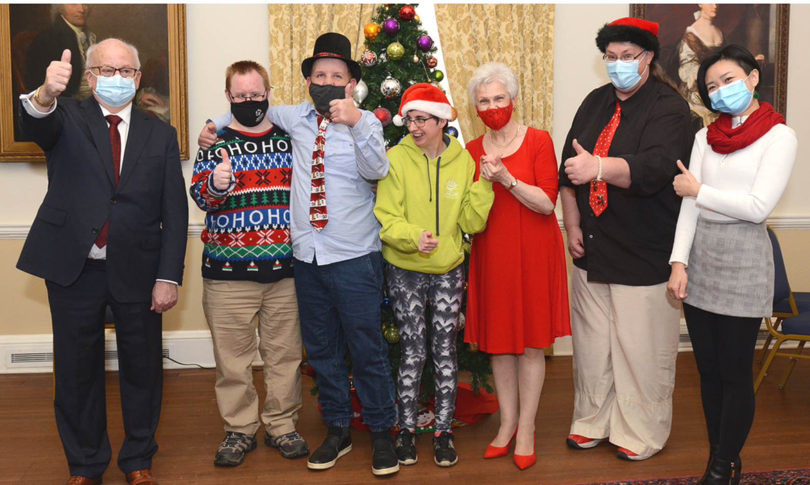
Christmas tree decorating event with L'Arche at Government House. 3 December 2021.

Building on the success of the 2020-21 fiscal year, the Lieutenant Governor continued virtual public outreach activities, particularly during the first half of the year when gathering limits resulted in the cancellation of events and tours. One significant benefit was that residents who cannot physically travel to Government House were able to engage with the Lieutenant Governor online and participate in activities.